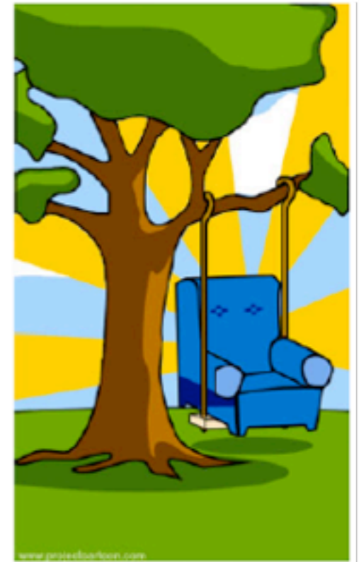
How the business consultant described it