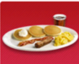
Build Your Own Jr. Grand Slam®