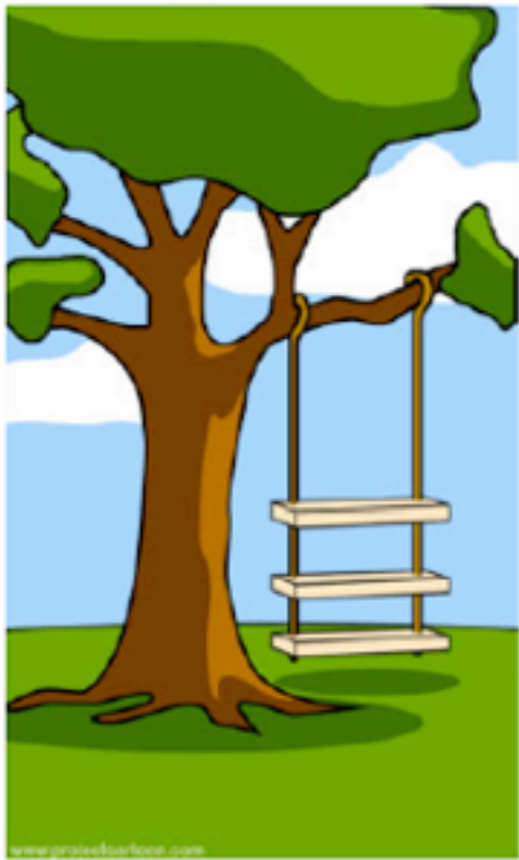
How the customer explained it