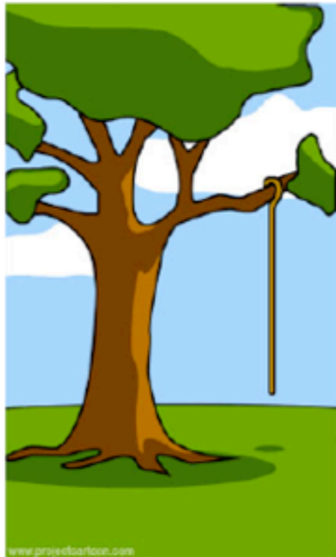
What operations installed