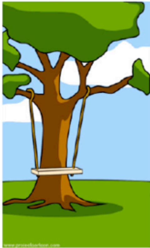
How the project leader understood it