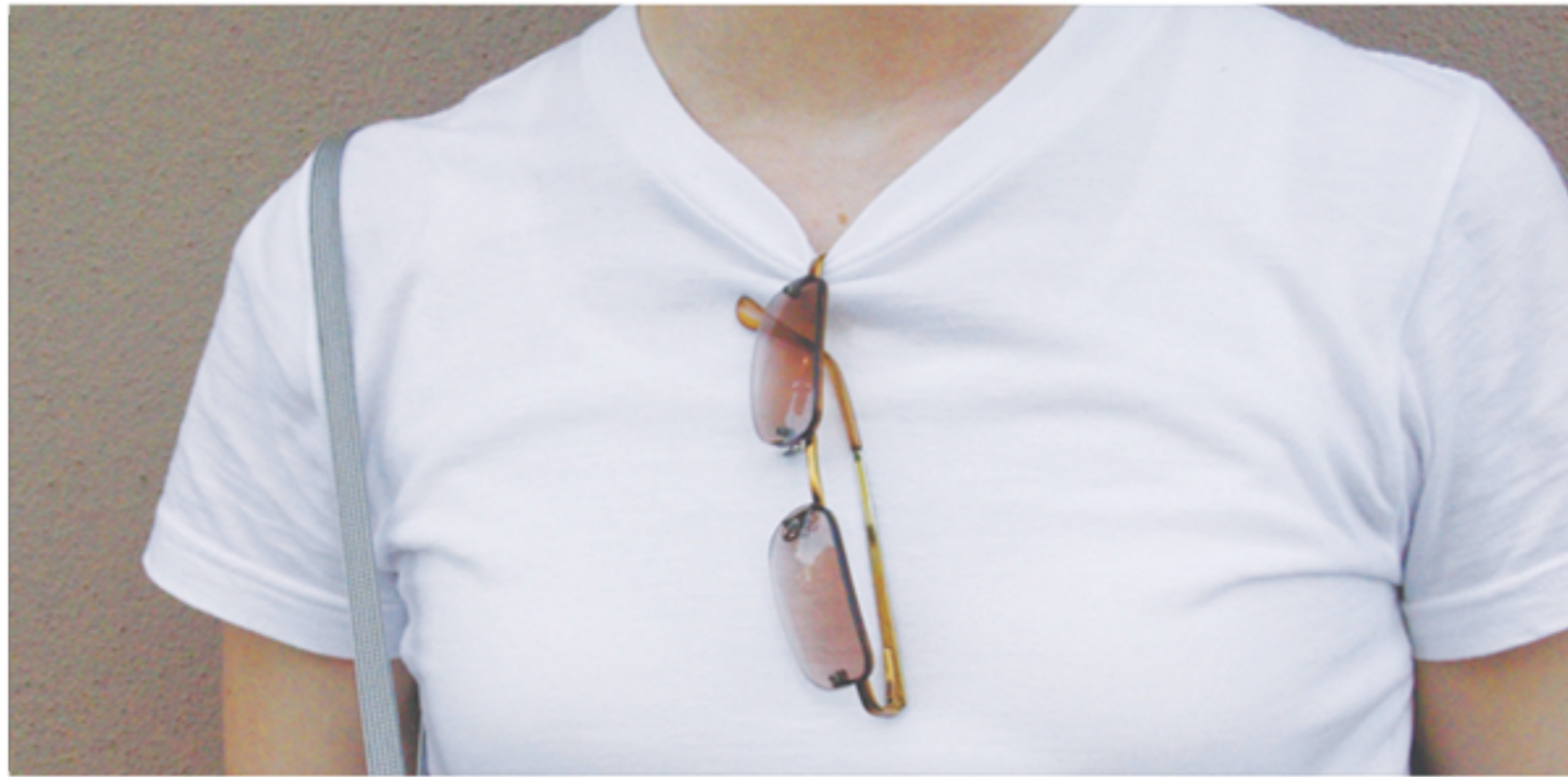
(Fulton Suri, 2000)

“Thoughtless acts are those intuitive ways we adapt, exploit, and react to things in our environment; things we do without really thinking.”