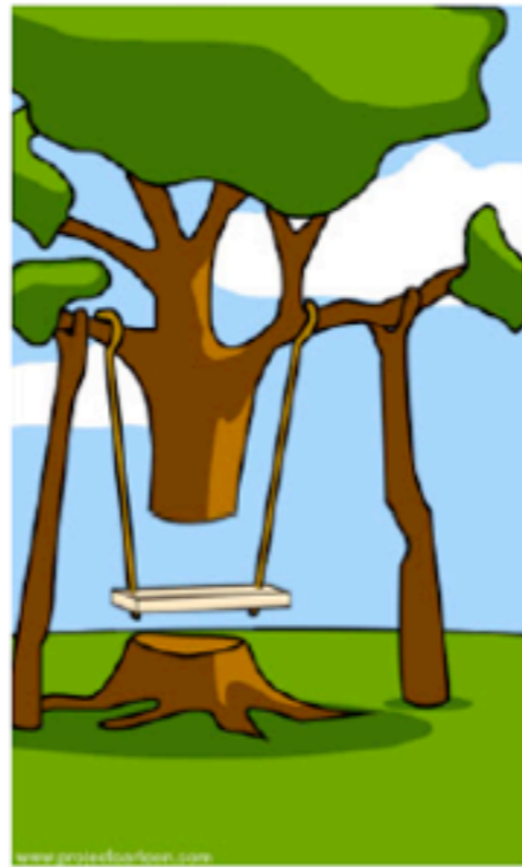
How the analyst designed it