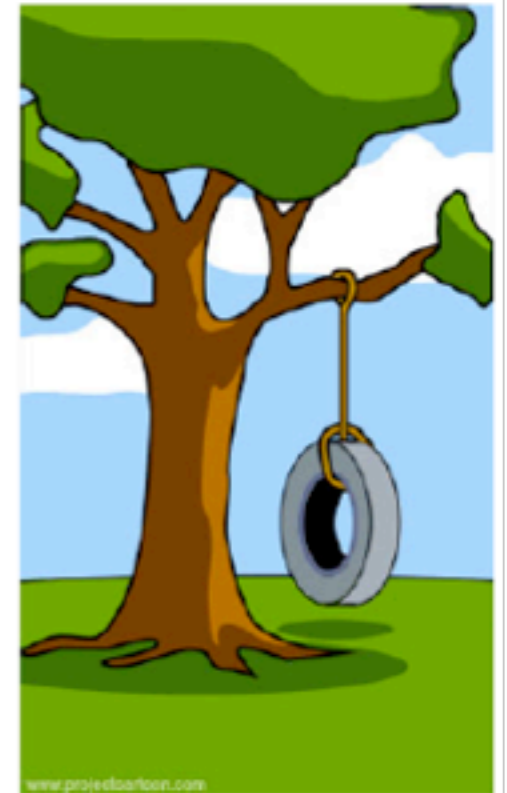
What the customer really needed