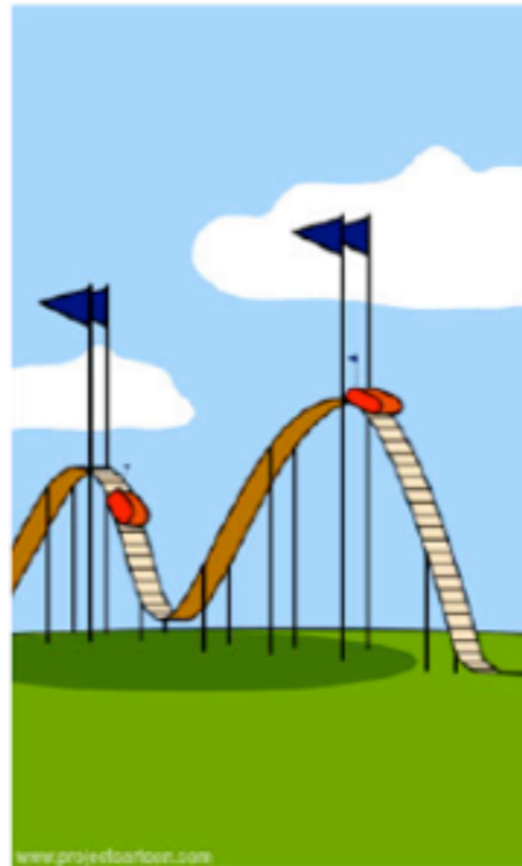
How the customer was billed