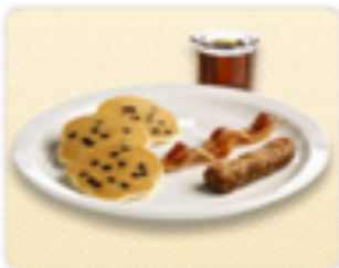
Chocolate Chip Pancakes