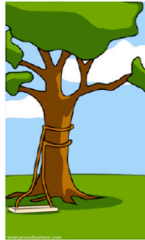
How the programmer wrote it